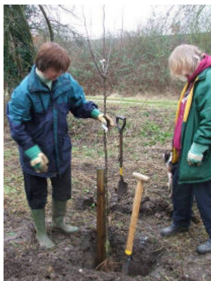
Volunteers plant one of the first young trees in the old Orchard

Funding for the orchard has been awarded by the Hanson Environment Fund, set up by Hanson in 1997 using the landfill tax money accumulated by this building materials company. This has been match funded by Blackwater Valley Countryside Partnership, which promotes community action in conservation and recreation and protects the Blackwater Valley for the enjoyment and well being of the whole community.